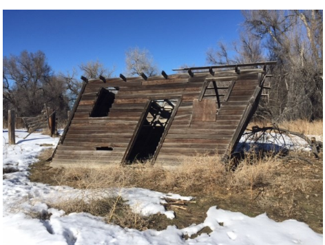
POI #4: Leaning Shack

POI #6: Poudre River Trail crosses the B.H. Eaton Ditch - 2.1 miles