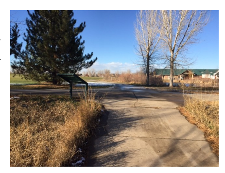
Looking north towards the Eastman Park pavilion and parking lot

END: Parking lot at Eastman Park, 7025 Eastman Park Dr, Windsor. From the interpretive sign, take the portion of the trail that heads directly north past the pond and pavilion to the parking lot. The playground will be on your right.