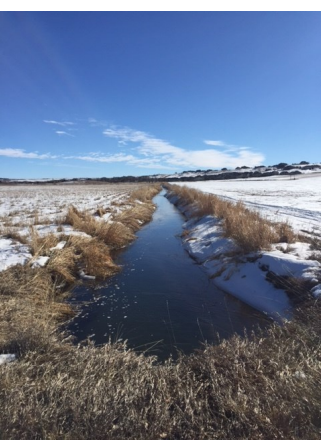
POI #6: The Eaton Ditch—L: Looking northwest, R: Looking southeast

POI #7: Treasure Island Demonstration Garden - 2.6 miles. Enjoyable in all seasons, take a moment to view the many different kinds of plants. Learn more at: <a href="www.windsorgov.com/forestry">www.windsorgov.com/forestry</a> or <a href="www.facebook.com/Treasure-Island-Demonstration-Garden-253227694875730/">www.facebook.com/Treasure-Island-Demonstration-Garden-253227694875730/</a>