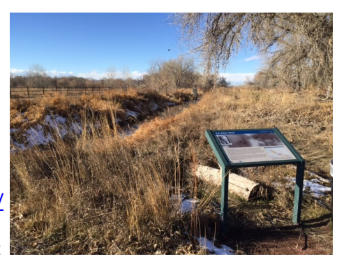
POI #3: Eaton wayside interpretive sign with ditch in background (looking northwest)