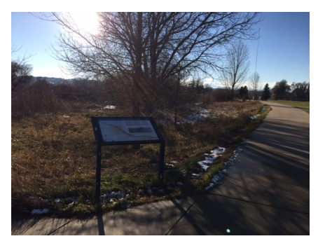
POI #8: Eastman Park wayside interpretive sign (looking southwest on trail)

END: Parking lot at Eastman Park, 7025 Eastman Park Dr, Windsor. From the interpretive sign, take the portion of the trail that heads directly north past the pond and pavilion to the parking lot. The playground will be on your right.