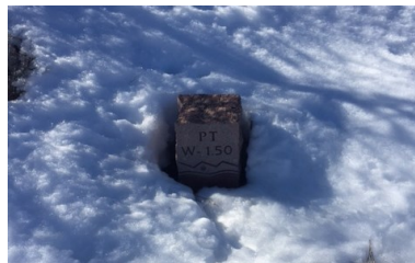
POI #5: 1.5 mile marker—Halfway Point

POI #5: HALFWAY POINT – 1.5 mile marker.