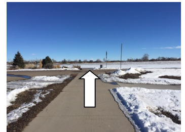
Straight ahead to stay on the Poudre Trail.

Continue heading east on the Poudre Trail: You will cross Laku Lake Road—continue straight on the Poudre Trail.