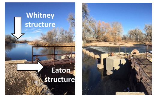
POI #1: Eaton ditch head gate with Whitney ditch diversion in background (looking upriver) and Eaton diversion structure with head gate (looking downriver)

POI #2: Eaton ditch - chart house and Parshall flume