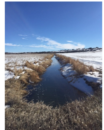
POI #6: The Eaton Ditch—L: Looking northwest, R: Looking southeast