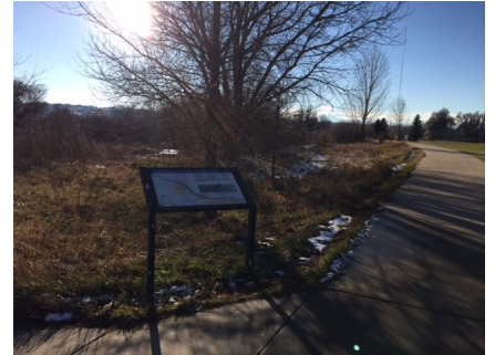
POI #8: Eastman Park wayside interpretive sign (looking southwest on trail)

END: Parking lot at Eastman Park, 7025 Eastman Park Dr, Windsor. From the interpretive sign, take the portion of the trail that heads directly north past the pond and pavilion to the parking lot. The playground will be on your right.