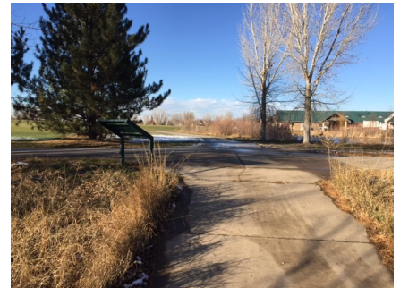
Looking north towards the Eastman Park pavilion and parking lot

END: Parking lot at Eastman Park, 7025 Eastman Park Dr, Windsor. From the interpretive sign, take the portion of the trail that heads directly north past the pond and pavilion to the parking lot. The playground will be on your right.