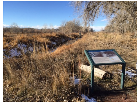
POI #3: Eaton wayside interpretive sign with ditch in background (looking northwest)

Continue heading southeast on the Poudre Trail: The Poudre Trail follows (and crosses) the Eaton Ditch to the next POI.