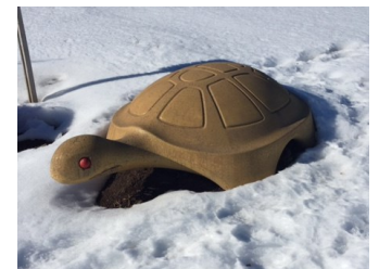
POI #7: Treasure Island Garden

Continue heading northeast on the Poudre Trail: The trail crosses over the Poudre River on a bridge.