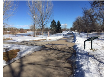
Approaching the wayside interpretive sign

Continue northeast on the Poudre Trail to the final POI: The trail runs parallel to the river. Do not take the smaller path that heads to the left.