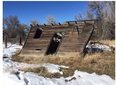
POI #4: Leaning Shack

POI #5: HALFWAY POINT – 1.5 mile marker.