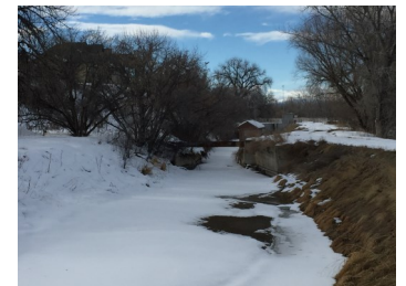
Greeley #3 Ditch—looking upstream towards charthouse and head gate.

POI #4: 71st Avenue Trailhead — 1.5 miles. Once you see the big red barn, you'll know you're almost there. Check out the story post for the Signature Bluffs / Sheep Draw Junction and learn more about the Poudre River Trail as well as the multitude of wildlife that exists along the river. Continue to follow the trail and cross over 71st Avenue to continue on the route to the next POI.