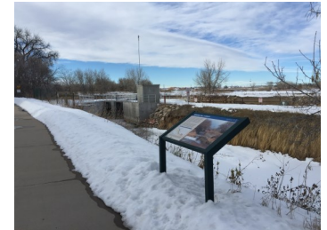
POI #3: Number 3 Ditch sign and modern head gate in background.

Proceed a little farther east along the trail and you will see a chart house and Parshall Flume, used for measuring surface waters and irrigation flow. Continue on until you reach a bridge that crosses the Greeley #3 Ditch—1.0 miles.