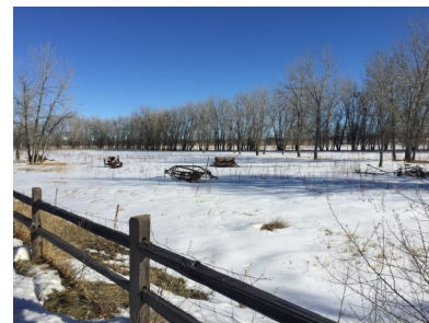
POI #5: Old farm equipment