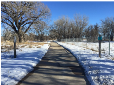
POI #6: HALFWAY POINT at chain link fence

POI #6: Chain link fence — 2.0 miles HALFWAY POINT