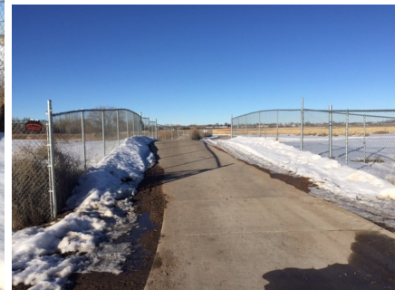
END: Story Post and trail over the Boyd and Freeman Ditch, near Rover Run Dog Park