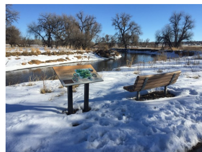
POI #7: Bird interpretive sign

POI #8: Intersection of the Poudre River Trail and the Sheep Draw Trail — 3.1 miles. At this trail intersection, turn left (east) to stay on the Poudre River Trail.