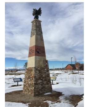
POI #1: PLC Eagle Tower with CALA interpretive sign pictured to its left.

Continue east and cross 83rd Avenue: Once you have crossed 83rd Avenue, you will turn directly north and continue on the Poudre River Trail to the next POI.