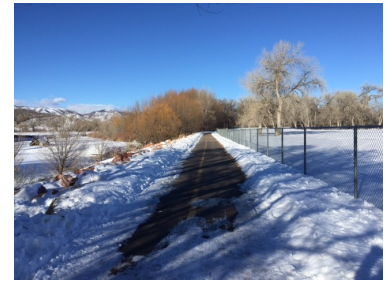
Fence bordering Cache la Poudre School on the right, river to the left.

In Lions Open Space, head northwest on the Poudre Trail. The trail will wind through the woods before reaching the chainlink fence that surrounds the Cache la Poudre School.