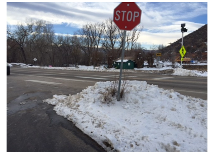
Trail crosses Rist Canyon Road

Continue to follow the Poudre Trail as it turns onto Rist Canyon Road near Vern's Place. The trail crosses Rist Canyon Road right before the Poudre River.