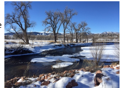
POI #2: A scenic view of the river

POI #3: The Poudre Trail takes a sharp left turn (1.2 miles) and proceeds northwest on the trail alongside 287-B/W County Rd 54G to the next POI.