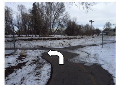
Turn left to stay on the Poudre Trail

POI #3: The Poudre Trail takes a sharp left turn (1.2 miles) and proceeds northwest on the trail alongside 287-B/W County Rd 54G to the next POI.