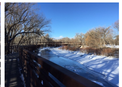
POI #1: L: Looking southeast, R: At other end of bridge, looking back upriver

Head back across the bridge to Lions Open Space: Go back the way you came towards the parking lot. When you reach the parking lot, continue northwest on the Poudre Trail along the river towards the next POI or follow the directions below to visit a “delightful diversion.”