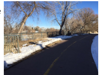
Approaching the viewing area (near bench)

Going, Going, Gone? But Not Forgotten. Depending on when you visit this POI, you may see the diversion dam and head gate of the Coy Ditch, as well as our Wayside Interpretive Sign, or you may not! As of 2015, the City of Fort Collins is in the process of removing the diversion structure and possibly the head gate of the ditch (visible on the north bank) to make way for a kayak course as part of its Poudre River Downtown Master Plan! If the diversion is present, you will notice a small gap in the middle which is a “canoe chute” or recreational in-channel diversion (RICD).