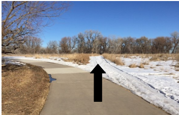
Take this dirt (snow) path.