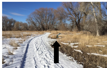
Here's the interpretive sign.