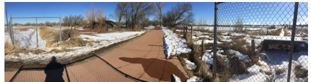
POI #1: Panoramic photo taken where the trail crosses a ditch and proceeds east between two ponds.

POI #1: Poudre Trail crosses ditch — .3 miles. Head straight east between two ponds. The trail then heads through a tunnel and turns slightly southwest.