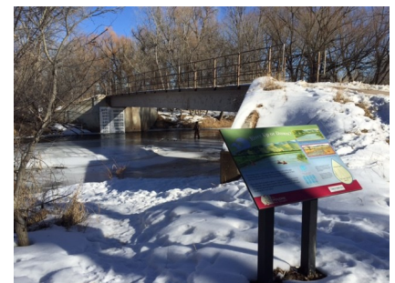
POI #4: River gage and interpretive sign.