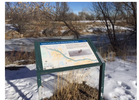
POI #2: Wayside interpretive sign with Poudre River in background (looking north)

Continue heading east on the Poudre Trail: The Poudre Trail goes under Shields St. — 1.1 miles. For safety, be sure you go under Shields St and not over it.