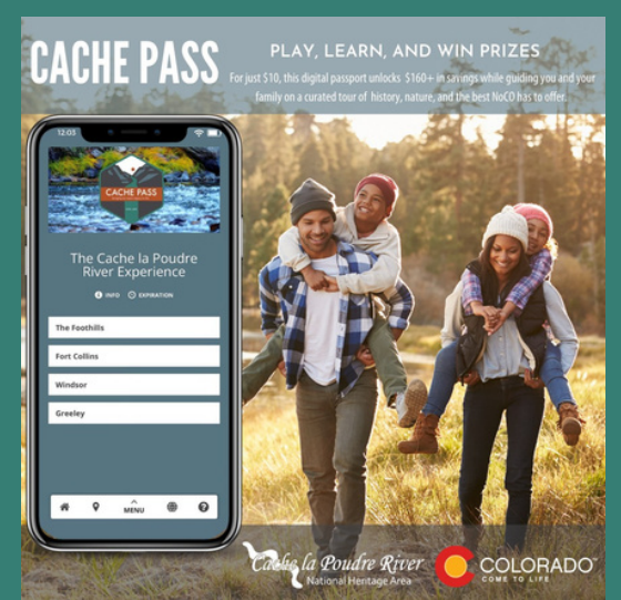
The Cache Pass is a great example of Management Plan Goal #4, Planning for Tourism.

The event, hosted by the Poudre River Trail Corridor, unveiled the master plan which featured amenities for the Red Barn at Signature Bluffs in Greeley. Also showcased was the Cycling Without Age program. CWA offers FREE trishaw rides to those who would like to visit the Poudre River Trail Corridor but can't ride a bike on their own.