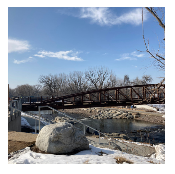
Seasonal Selfie: Take a selfie with the Whitewater Park in the background.